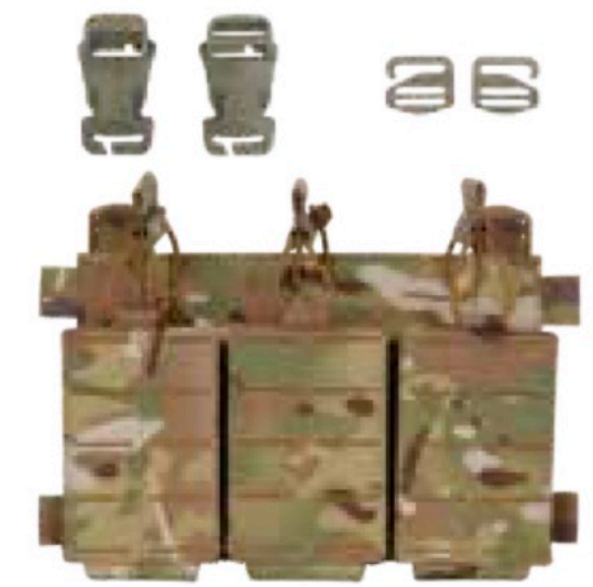
* Both buckle sets and G-Hooks included