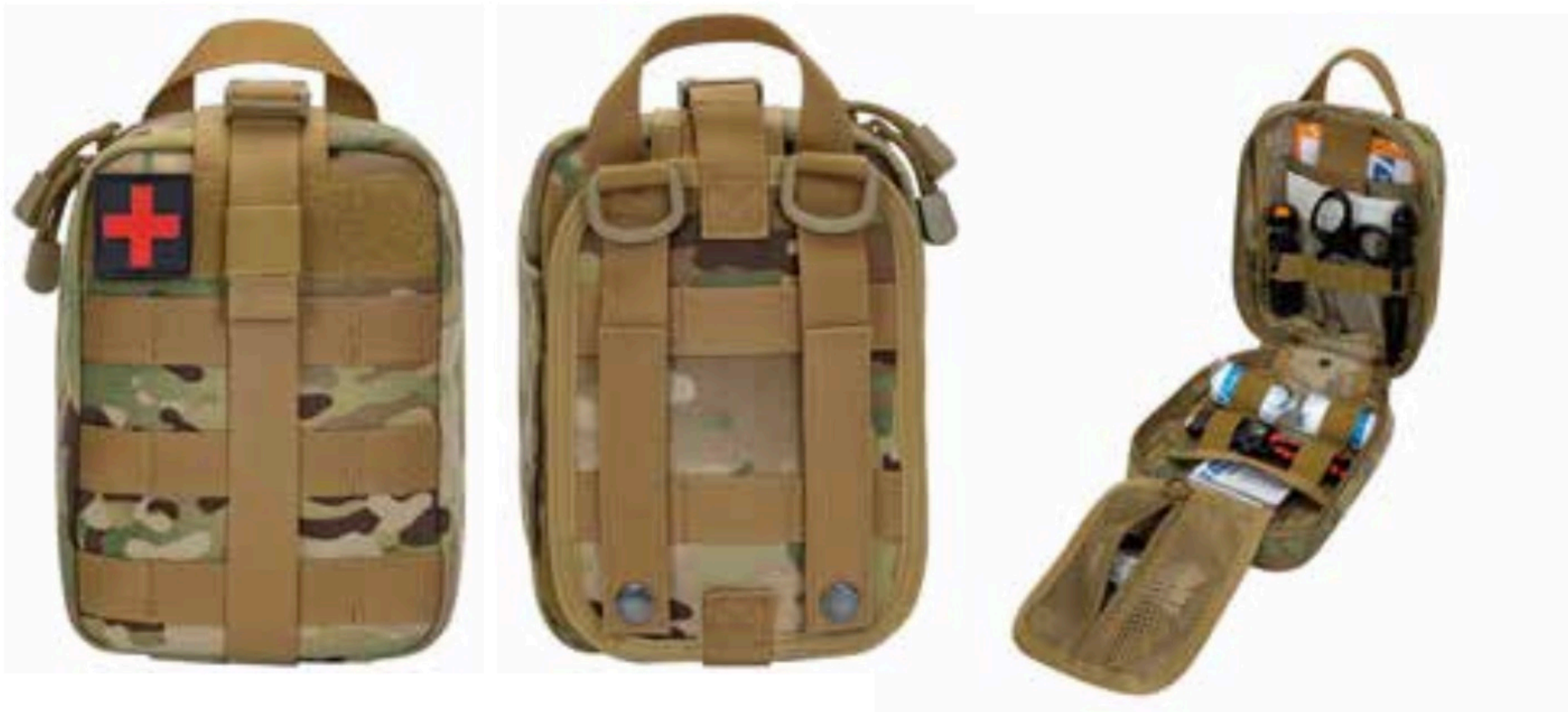
901-75 Medical Pouch