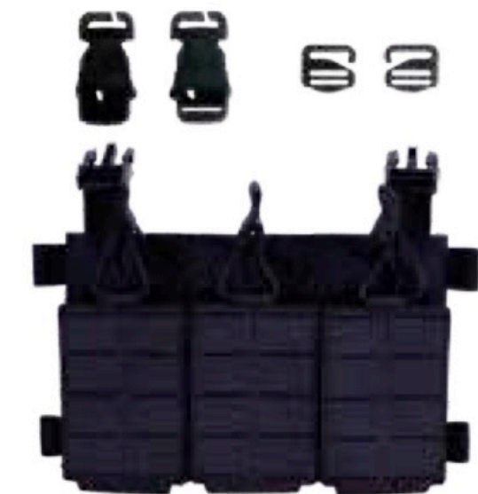
* Both buckle sets and G-Hooks included