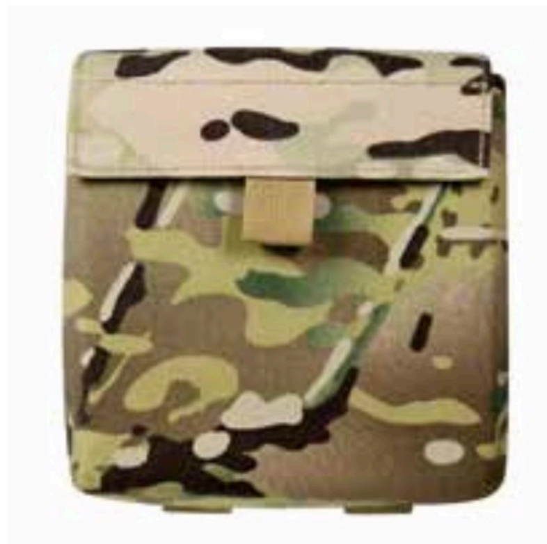
901-78 Side Plate Pouch